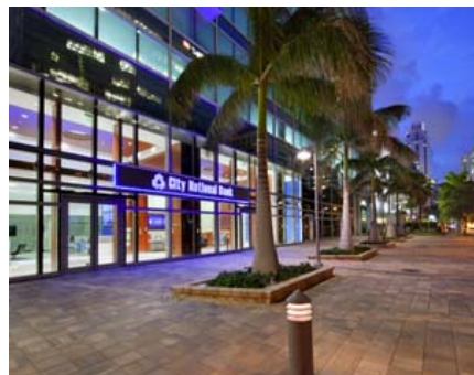
City National Bank

Print | Email | Reprints & Permissions | Post a Comment